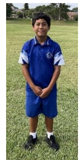
Troy P 5P 12 Years Boys Touch Football