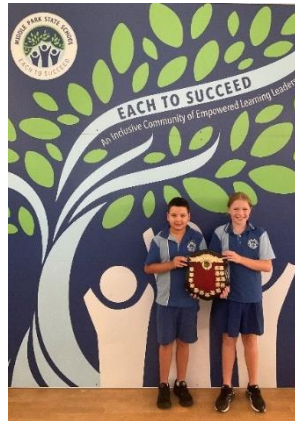
Cuthbert House Captains

Students who placed 1 st , 2 nd , 3 rd or 4 th in the 10, 11 and 12 years age groups have been invited to attend the Northern Eagles District Cross Country trial on Tuesday, 23 April at Limestone Park, Ipswich.